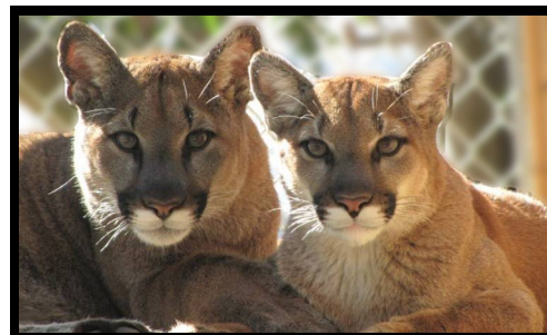
“Kuma” and “Kyla” our resident Mountain Lions

Please call (707) 992-0274 for an appointment