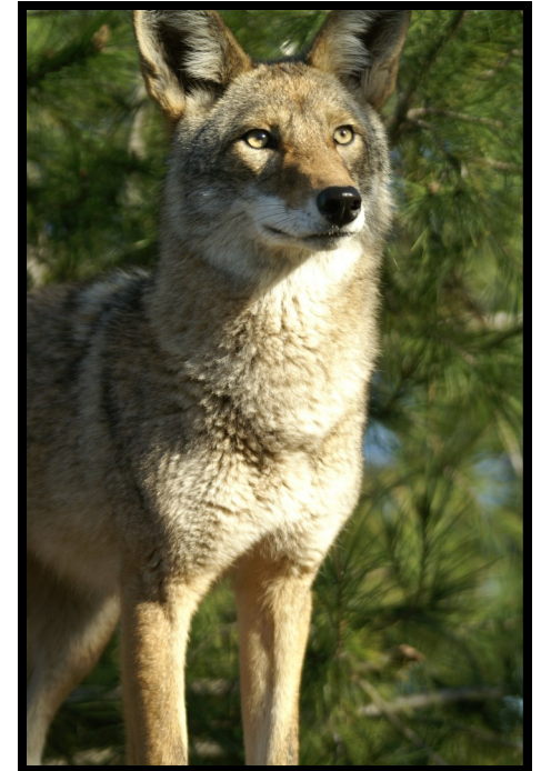
“Wiley”, one of our resident Coyotes, is part of our Education Team.