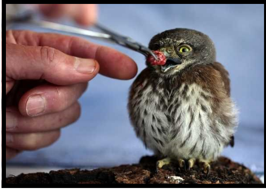
Northern Pygmy Owl being fed lunch