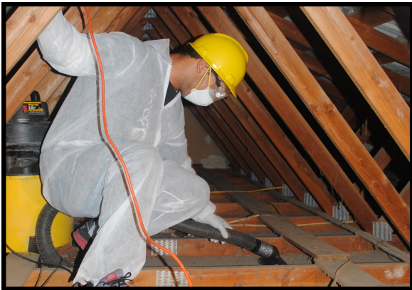
Bat Feces Removal

All proceeds go to the non-profit work of Sonoma County Wildlife Rescue