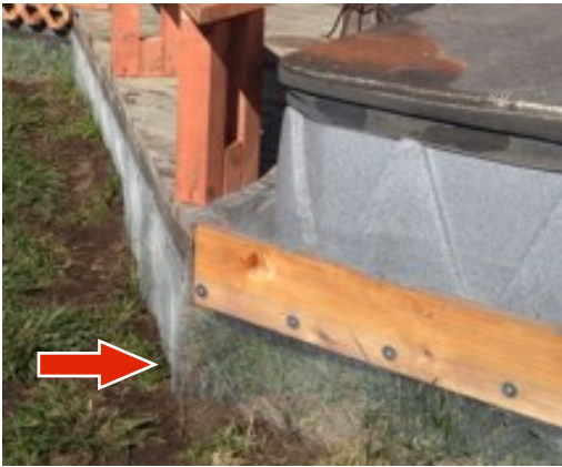
Crawl Space Access Point Sealed with Hardware Cloth

Exclusion is a humane and life-oriented approach to pest control. Techniques are applied to remove intrusive animals and prevent future use of your building or yard by wildlife. Rather than trap and relocate animals, which is illegal and can expose wildlife to diseases and territorial conflicts, AWES technicians identify and remove the substances that originally attracted the animal. This solution motivates the animal to leave the property and reduces the likelihood of other animals getting in.